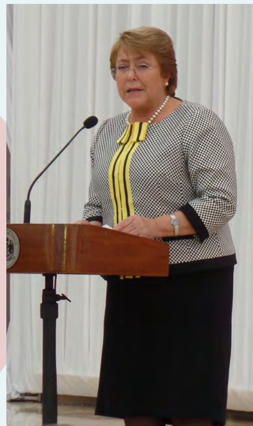
President Michelle Bachelet of Chile addressing an ABAC luncheon in Santiago.

Leaders in November 2014 in Beijing, China. ■