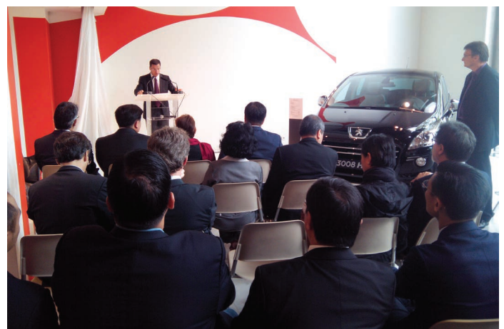
Peugeot executives receive the Philippine business delegation