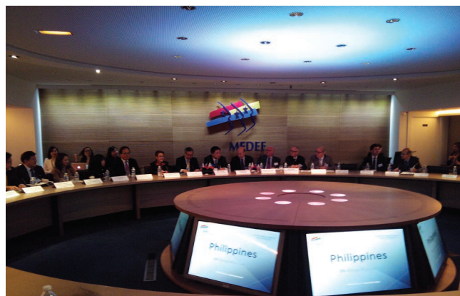
MEDEF welcomes the Philippine business delegation at a business conference with the French private sector.

MAKATI BUSINESS CLUB THE FORUM FOR CONSTRUCTIVE IDEAS