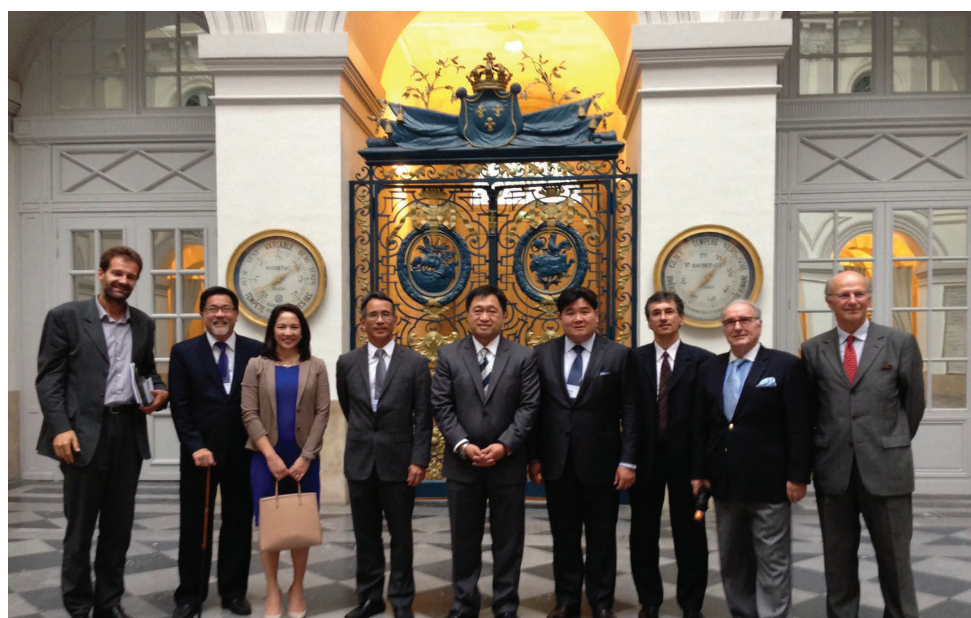
Official delegation meets with the Bordeaux Chamber of Commerce.